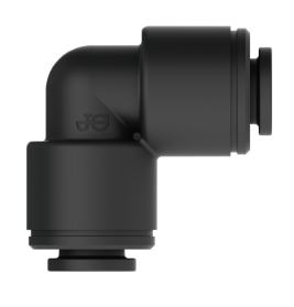
Profile Type 2